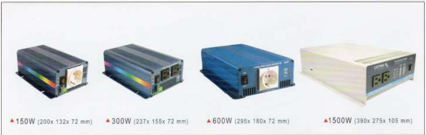
▲ 150W (200x 132x 72 mm)